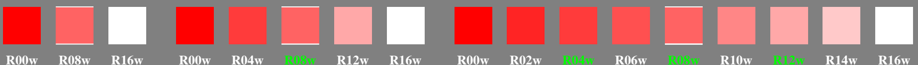
hek40-7n, Test samples: 3, 5 and 9 colour steps, greu=0.500, expu=1.000, expa=1.000, expi=1.000

Three, 5 and 9 colour steps, produced visual linearization r: 0, 108, 270, 435, 600, 710, 820, 928, 1000 i: 0, 143, 230, 314, 390, 524, 658, 787, 1000 L^*_{TUBLOG,U}=[50/\log(5)] \log(Y/Y_U)+50, Y_N=4, Y_U=20, Y_W=100 Red R00w – Red R16w = White W