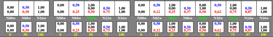
gen30-3a, Test samples: 3, 5 and 9 colour steps, grea=0.500, expa=1.000, expb=1.000

L^*_{TUBLOG,U} = 50 \log(Y/5Y_U) + 50 , Y_N=4 , Y_U=20 , Y_W=100