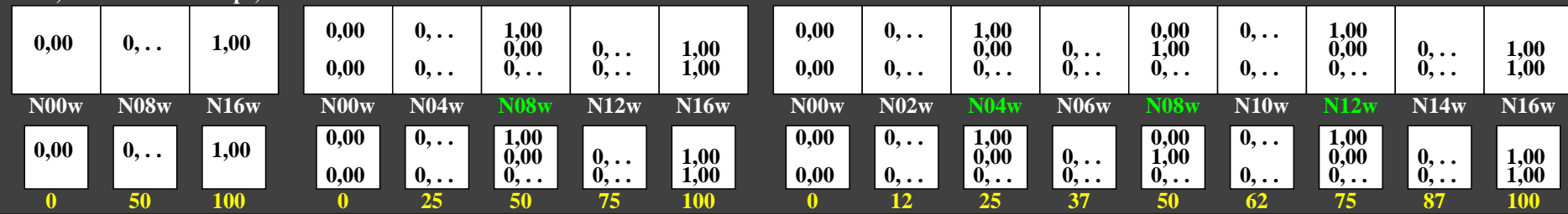
gel40-5n, Test samples: 3, 5 and 9 colour steps, greu=0,500, expu=2,000, expa=2,000