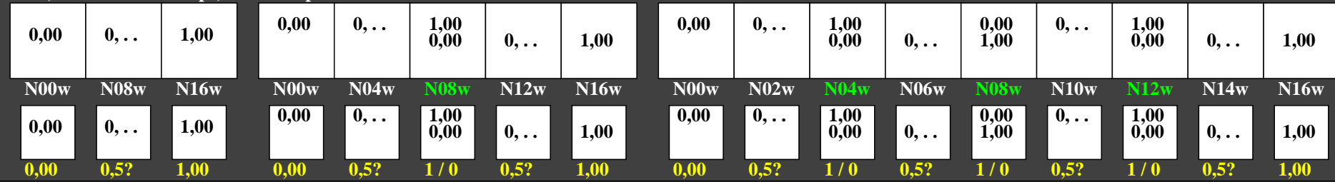
gel40-3n, Test samples: 3, 5 and 9 colour steps, greu=0,500, expu=2,000, expa=2,000