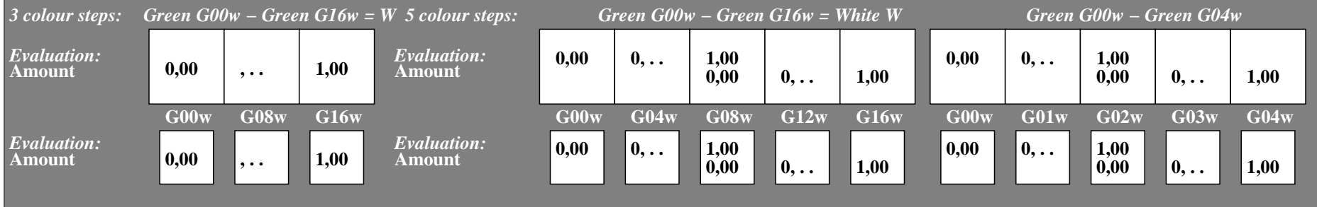
fet80-3n, Evaluation sheet: 3 and 5 colour steps