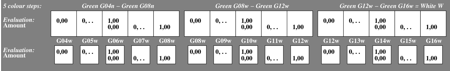
fet80-7n, Evaluation sheet: 5 colour steps

TUB-test chart fet8; Adjacent and separate colour samples for intervall scaling Evaluation example and evaluation of colour steps of the series G – W with 3 or 5 of 17 steps