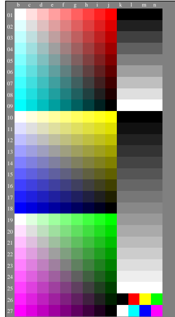
AE490-71 Part of test chart AE49 with 1080 colours; 9 or 16 step colour scales; data in column (b-n); rgb 1-003110-L0 cmy6

Discriminability of chromatic colours Remarks: This test uses many colour scales of 9 steps Hue plane Red - Cyan blue (rows 01 to 09, column b to j) Discriminability of 81 chromatic colours Are all the 81 colours different? Yes/No Only in case of "No": How many are different? Of the 81 are ..... different Hue plane Yellow - Blue (rows 10 to 18, column b to j) Discriminability of 81 chromatic colours Are all the 81 colours different? Yes/No Only in case of "No": How many are different? Of the 81 are ..... different Hue plane Green - Magenta red (rows 19 to 27, column b to j) Discriminability of 81 chromatic colours Are all the 81 colours different? Yes/No Only in case of "No": How many are different? Of the 81 are ..... different Result: Of the 243 (=3x81) colours are ..... different Artifacts, please describe if visible: ..... ..... Remarks about the creation and content of the PDF files: Sometimes "colour smoothing" is a default setting. In this case the 9 steps are often not visible and may be counted as one step. Sometimes "optimizing the PDF output for the web" is a default setting. For example this setting may reduce the 1080 colours on a page to 256 colours.