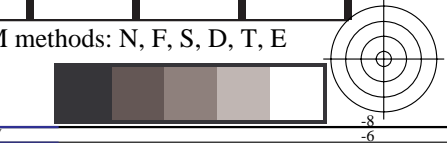
Figure B4 and/or D4 of the ISO/IEC-test charts; w^* - cmy_n^* ; w^* - olv(cmy)^* ; 16 visual equidistant steps of colour series: LAB^* \rightarrow \Delta LAB^* ; LM methods: N, F, S, D, T, E

16 colours according to ISO/IEC 15775 and 19839-X; setcolor -> setcmykcolor, setgray