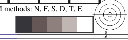
Figure B4 and/or D4 of the ISO/IEC-test charts; w^* - cmy^n ; w^* - olv(cmy)^* ; 16 visual equidistant steps of colour series: LAB^* \rightarrow \Delta LAB^* ; LM methods: N, F, S, D, T, E

16 colours according to ISO/IEC 15775 and 19839-X; setcolor -> setcmykcolor, setgray