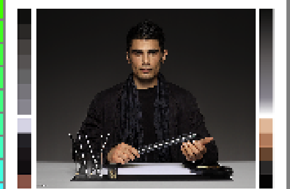
fel90-7N, Dark HDR Image from Berliner Hochschule fuer Technik, Prof. Suesel; PS operators settransfer, 3 colorimage

TUB registration: 20240301-fel9/fel910np.pdf / .ps application for evaluation and measurement of display or print output