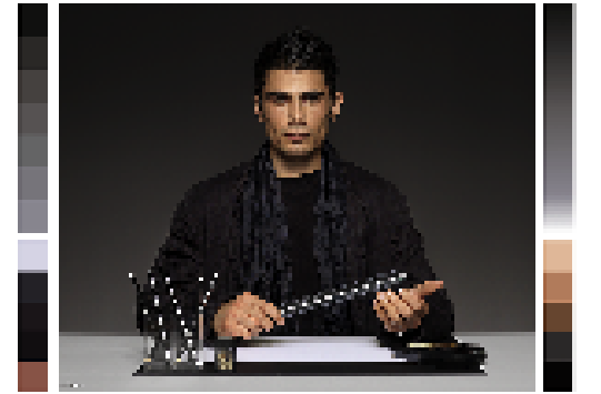
fel90-7N, Dark HDR Image from Berliner Hochschule fuer Technik, Prof. Suessli; PS operators settransfer_3 colorimage

TUB registration: 20240301-fel9/fel910na.txt / .ps application for evaluation and measurement of display or print output