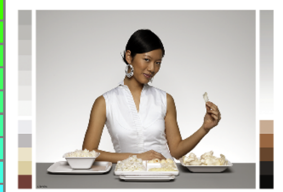
fel60-7N, Light HDR Image, Berliner Hochschule fuer Technik, Prof. Suesst; PS operators seittransfer, 3 colorimage

fel60-7N, Page 1/16, Test chart 2G with 40x27=1080 colours; digital equidistant 9 or 16 step colour scales; Colour data in column (A-n): rgb + cmy0 (A_j + k26_n27), 000n (k), w (l), nnn0 (m), www (n), colorm = 0, xchart = 0, pchart = 0