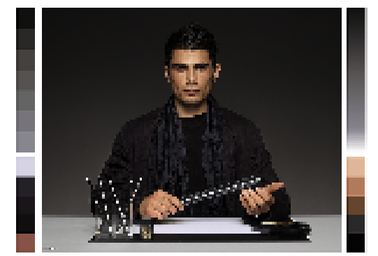
fel50-7N, Dark HDR Image from Berliner Hochschule fuer Technik, Prof. Suessli; PS operators settransfer_3 colorimage

TUB registration: 20240301-fel5/fel510na.txt / .ps application for evaluation and measurement of display or print output