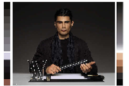
fel50-7N, Dark HDR Image from Berliner Hochschule fuer Technik, Prof. Suessli; PS operators settransfer_3 colorimage

TUB registration: 20240301-fel5/fel510na.txt / .ps application for evaluation and measurement of display or print output