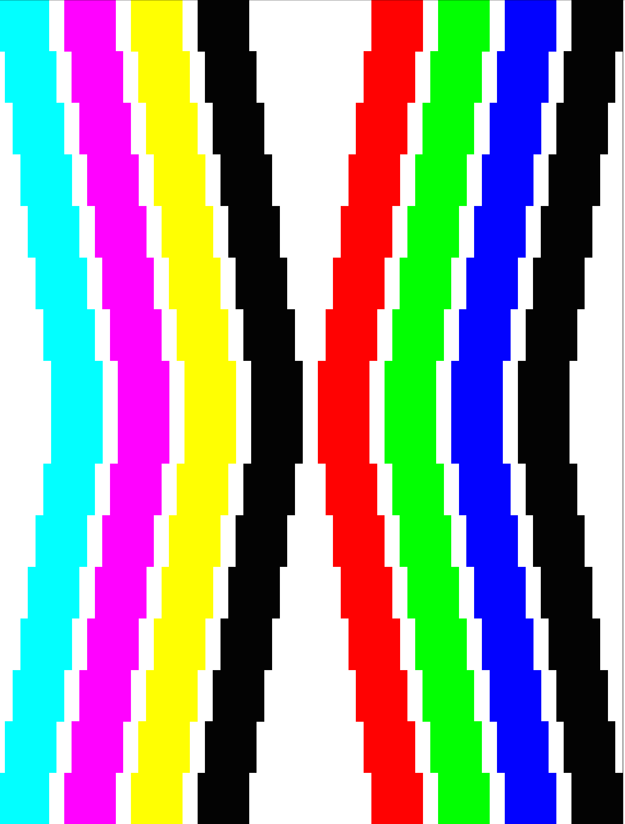
Fig. 1: Colour area 14 mm x 14 mm; Yield / Emission: 40% geometrical colour area coverage and 65% colour coverage; PS operator: cmy0* / 000n* setcmykcolor BAM-test chart no. BE11 Yield/Emission: 40% geometrical and 40% visual area coverage output: olv* setrgbcolor / w* setgray

www.ps.bam.de/BE11/10Q/Q11E00FP.PS/.PDF; linearized output F: Output Linearization (OL) data BE11/10Q/Q11E00FP.DAT in File (F) 224 mm (+/- 1 mm)